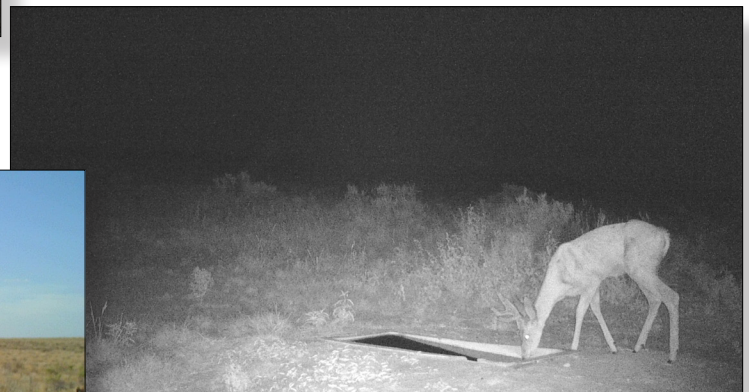
Views from a game camera on an Open Space Preserve