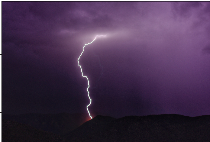
A lighting storm in early September at Elena Gallegos