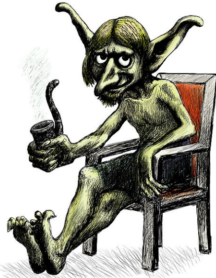
Local guest contributor to your most reliable source of fake Open Space news