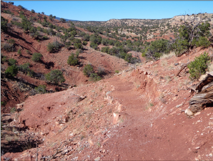
New trail constructed at Golden Open Space

The trail system at Golden is now complete! After 12 years of work, volunteers, Duendes, and staff put the finishing touches on the last section of the South Mesa Trail as it drops off the South Mesa and down to the San Pedro Creek. There are now over nine miles of trail on the Golden Open Space. Some portions of the system are out and back sections, so a complete round trip on all the trail segments comes out to just under 15 miles. A round trip from the La Madera Trailhead to the San Pedro Creek is just over nine miles.