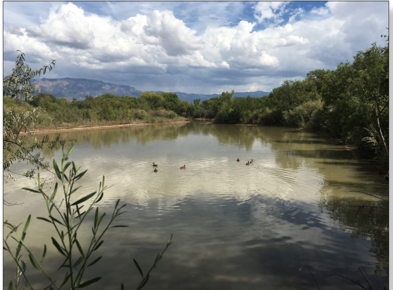
View from a wildlife blind at Bachechi/Alameda Open Space wetland, owned and managed by both County and City Open Space.

City and County Open Space are often partners in preservation efforts; one of many examples is the Bachechi/Alameda Open Space in the bosque off Alameda.