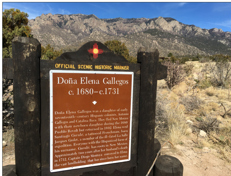
The new historic marker, dedicated September of this year.

For more information on the New Mexico Historic Women Marker Initiative, visit nmhistoricpreservation.org .