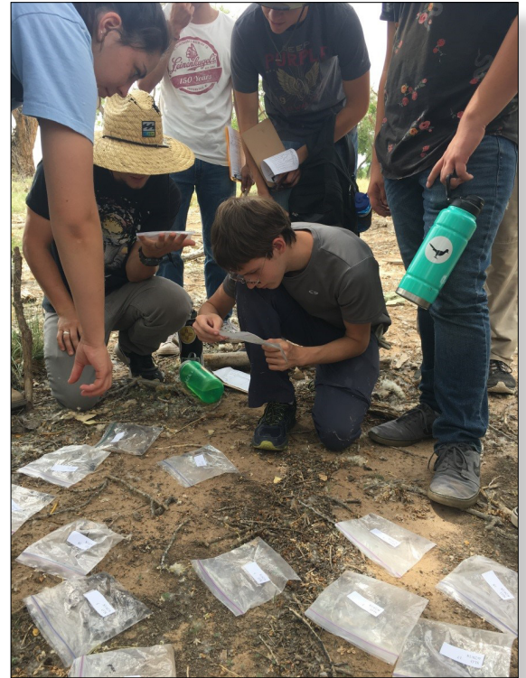
BASS students in the field

The partnership between BEMP and the City of Albuquerque, known as BEMP After School Science (BASS), will grant opportunities for K-12 students, particularly in identified Title 1 Albuquerque Public Schools, to participate in hands-on citizen science in their bosque , school yards and neighborhood parks. At the completion of the program, students will present their findings to community members and City of Albuquerque Open Space Division staff. The students' findings from BASS will directly support the Open Space Division's restoration, monitoring and ecological concerns and management actions.